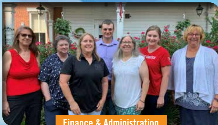
Finance & Administration